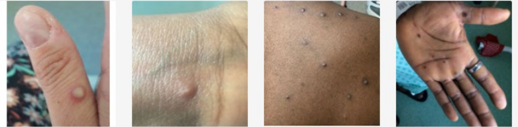
Visual Examples of Monkeypox Rash